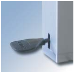
Lever release system bottom