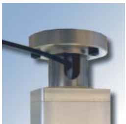
Hydraulic- release system top