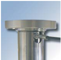
Bowdenwire release system top

Thanks to our modular system, the Bansbach guided columns are variable in length and can be used in various applications. They are supplied according to your specifications along with a customized, pre-installed gas spring that suits your specific needs minimizing assembly time and costs.